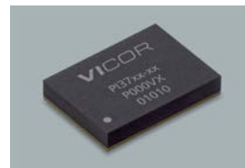
ZVS buck-boost regulators