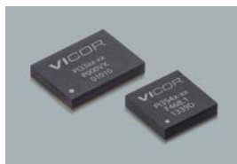
ZVS buck regulators

Inputs: 12V (8 – 18V), 24V (8 – 42V), 48V (30 – 60V)