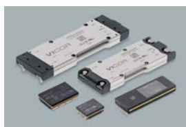
BCM bus converter modules