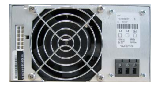
New Steel Guard